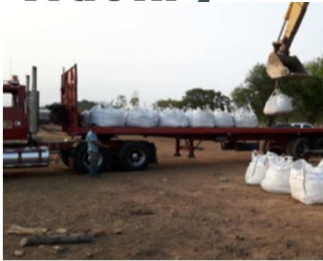
IAT Copper Mine, Africa 2017