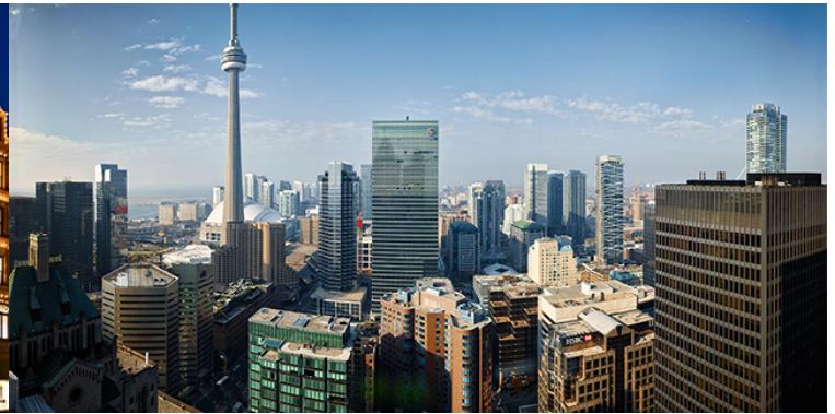
IAT Toronto, Canada