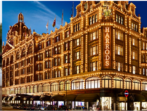
IAT London, England